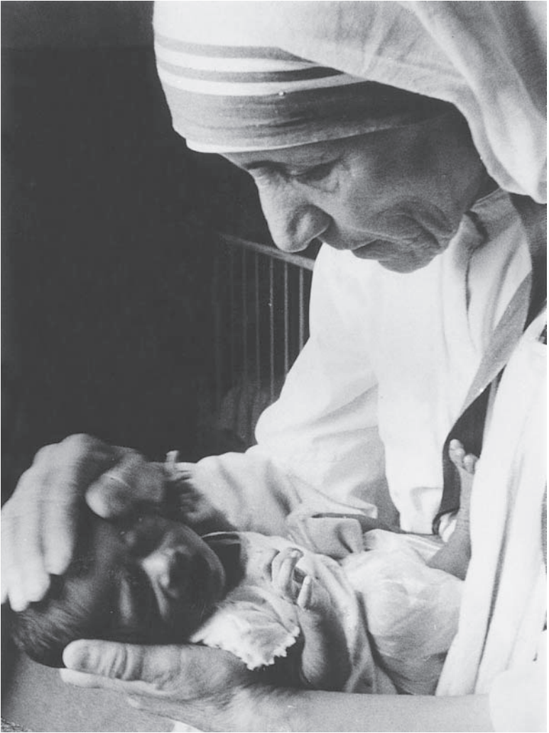
Plate 9 Mother Teresa of Calcutta (1910–1997).