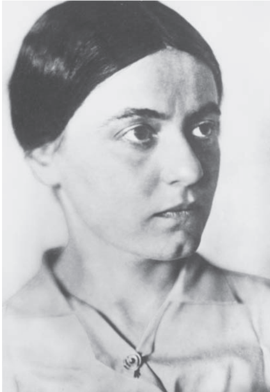
Plate 10 Edith Stein (Teresa Benedicta of the Holy Cross, 1891–1942).

their lives were witness to truth against falsity and love against hate. Theologians as early as Thomas Aquinas and as recently as Karl Rahner have asked for a more generous understanding of martyrdom as a complex response to death involving fortitude, faith, love, and a willingness to die for truth. Pope John Paul II has argued in a number of places that the best evidence of Christian ecumenism is to be found in the martyrs of the twentieth century – Catholic, Protestant, and Orthodox – who have given