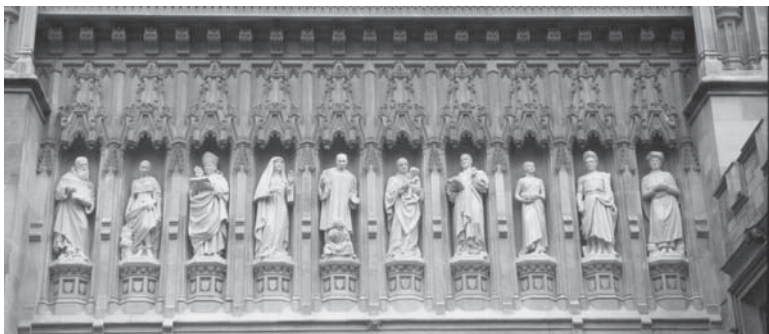
Plate 11 Westminster Abbey's homage to the contemporary martyrs.

passive martyrs (the Jesuanic martyrs about whom Sobrino has written) – the disenfranchised who simply “disappeared,” dead who remain nameless. 13