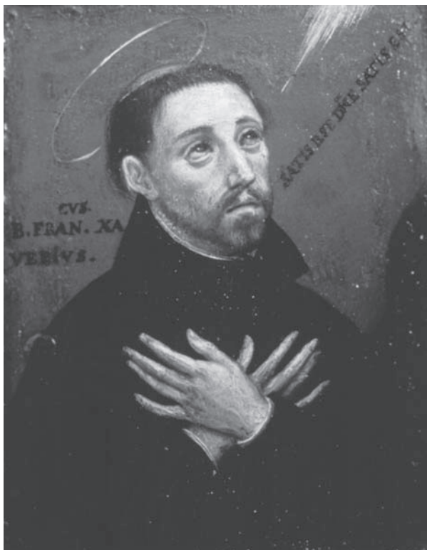
Plate 3 Saint Francis Xavier (1506–1551). Museo Casa de Murillo, La Paz.

great Spanish contemplative whose religious sisters would establish in France convents that had a tremendous impact on French spirituality in the seventeenth century.