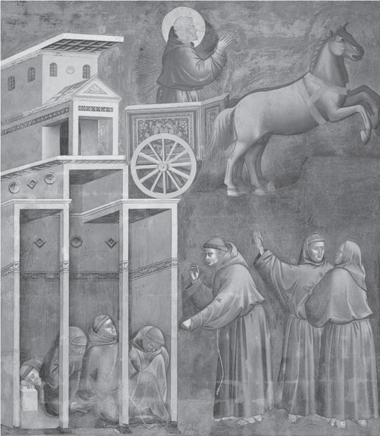
Plate 2 Saint Francis of Assisi (?1181–1226).

to the papacy, taking the name of Gregory IX. He had known Francis and had served as the cardinal protector of the Franciscan Order. Almost immediately after his installation as pope, Gregory did two things that put the canonization of Francis on the fast track: he ordered a life of Francis to be written and he issued a